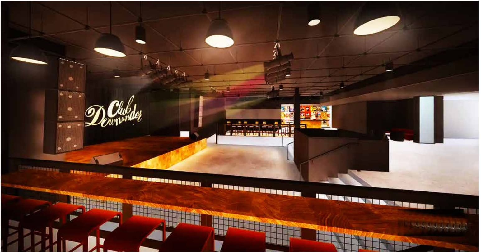
Club DownUnder is the premier student-run entertainment venue in the Union that hosts concerts, comedians, special events, and more, according to the New Student Union Project website.