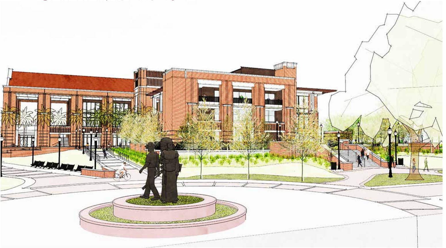
View From Integration Statue