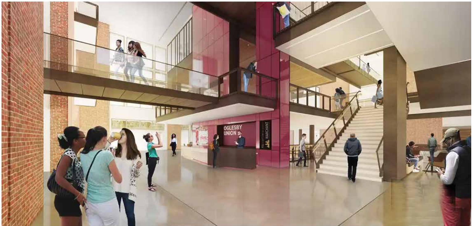
The Welcome Lobby and Lounge is the focal point and crossroads of the new FSU Student Union, according to the New Student Union Project website.