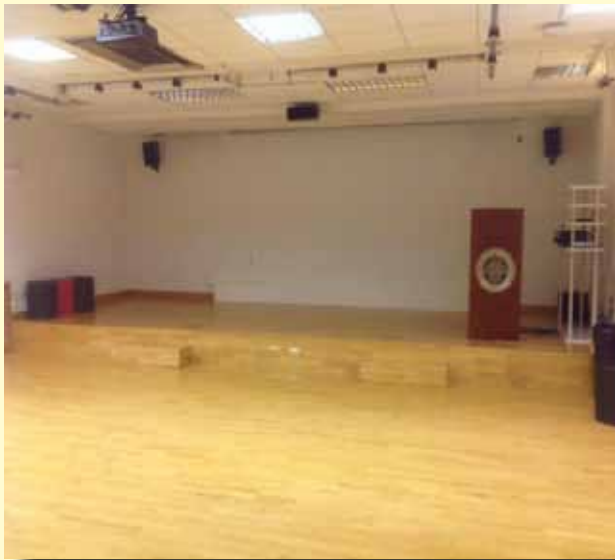
Performance room for Dance and Theater Classes.

The Study Centre offers students a fully working library and three computer labs, operated by a professional librarian, IT, and library assistants. The library has a wide variety of material that includes movies, books, music, travel guides, and more. There is also a conservatory for quiet studying. To further accommodate students with laptop computers, the Study Centre has implemented wireless Internet Access throughout the building and flats.