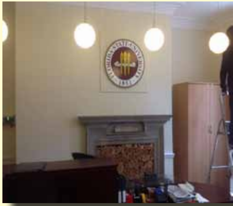
The Main Office