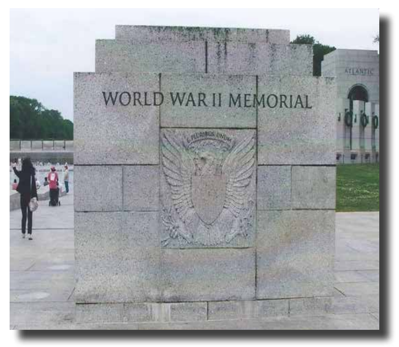
THE WORLD WAR II MEMORIAL