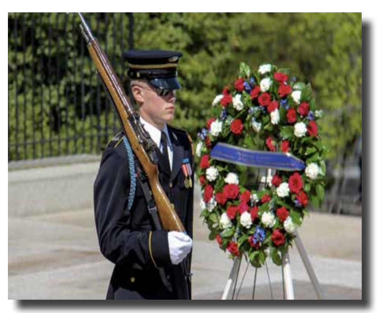
HONOR GUARD AND HONOR FLIGHT WREATH.

After a delicious boxed lunch on the bus, we motored to a central location to see the remaining Memorials: Lincoln Memorial, Vietnam War Memorial, Korea War Memorial, and the Marine Corps Memorial - Iwo Jima. This was followed by the Changing of the Guard ceremony at Arlington National Cemetery Tomb of the Unknowns When an Honor Flight is attending this Ceremony, an honor wreath is so designated. The lowering of the Flag Ceremony followed