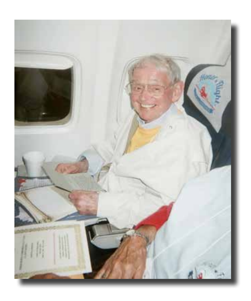
Photo taken by Congresswoman Gwen Graham an Honor Flight Tallahassee Guardian May 2, 2015