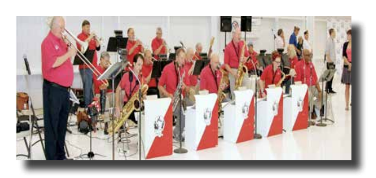
THE TALLAHASSEE SWING BAND