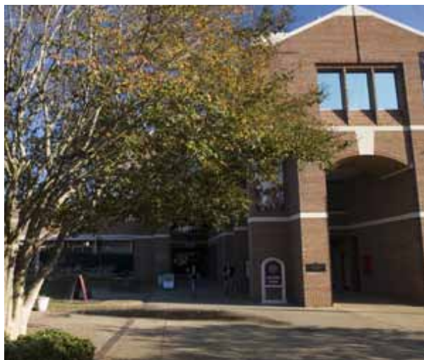
Turner Building of the old Oglesby Union complex