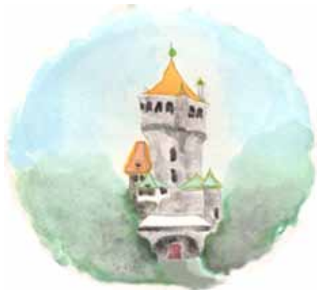
My very first watercolor

First tried watercolors when I was a visiting Professor of Information Technology in Singapore, 2000-2001. My family was with me during the Fall Semester and we all returned to the US for Christmas. Our son began studies at TCC and my Wife stayed in Tallahassee with him. I returned by myself to Singapore and became bored. I bought a shower curtain to place on the dining room table and some children's watercolors and brushes. Following are my first Watercolors painted on paper plates: