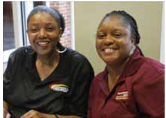
FSU Parking Representatives