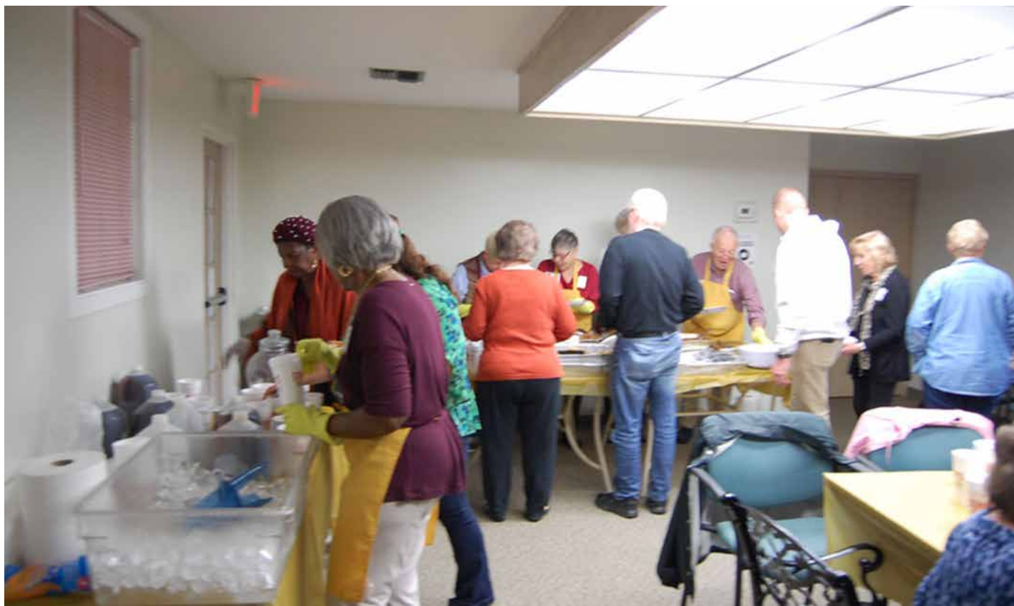
Fill Your Plate!