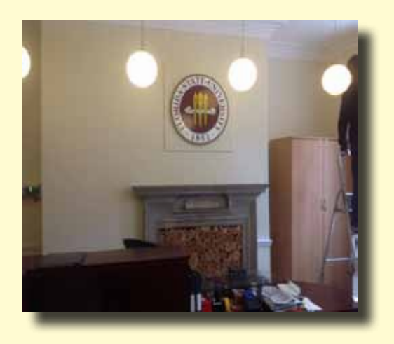
The Main Office