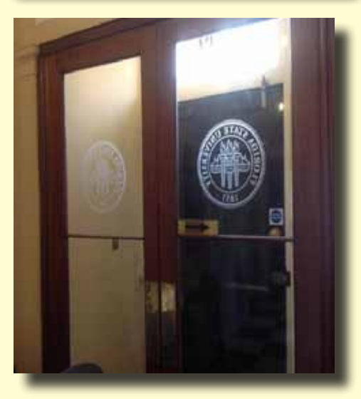
Adjacent to the Stairwell is the entrance to the Main Office.