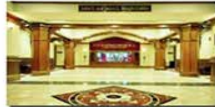
Ruby Diamond Concert Hall Main Lobby