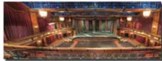
Ruby Diamond Concert Hall Stage