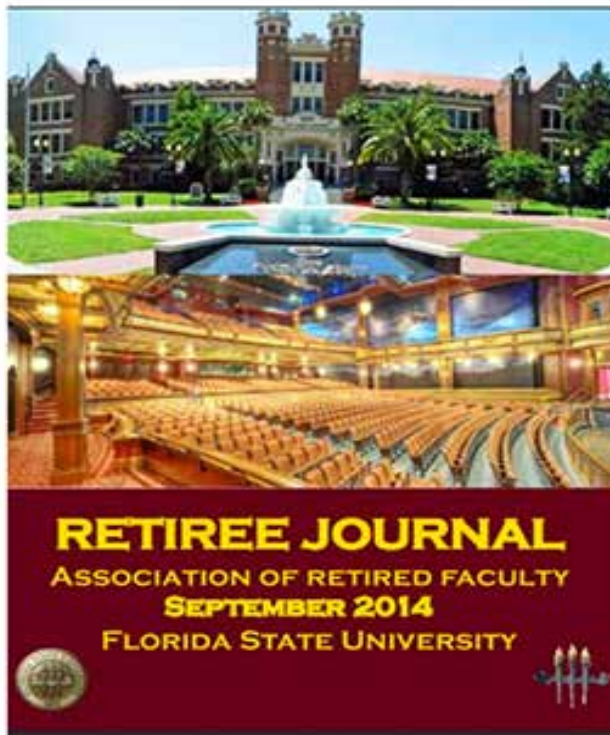
Westcott and Ruby Diamond Concert Hall