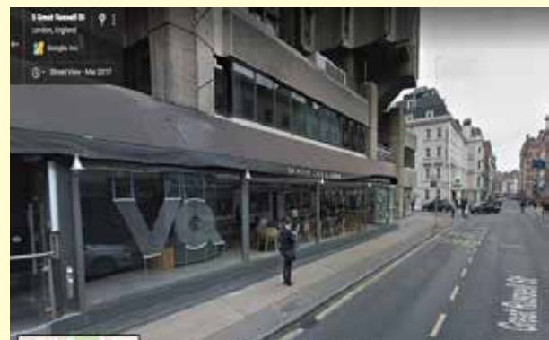
Restaurant where we ate a very good and reasonable lunch, less than 2 blocks from the Centre.