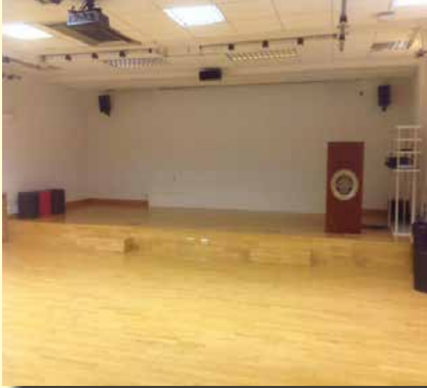
Performance room for Dance and Theater Classes.

The Study Centre offers students a fully working library and three computer labs, operated by a professional librarian, IT, and library assistants. The library has a wide variety of material that includes movies, books, music, travel guides, and more. There is also a conservatory for quiet studying. To further accommodate students with laptop computers, the Study Centre has implemented wireless Internet Access throughout the building and flats.