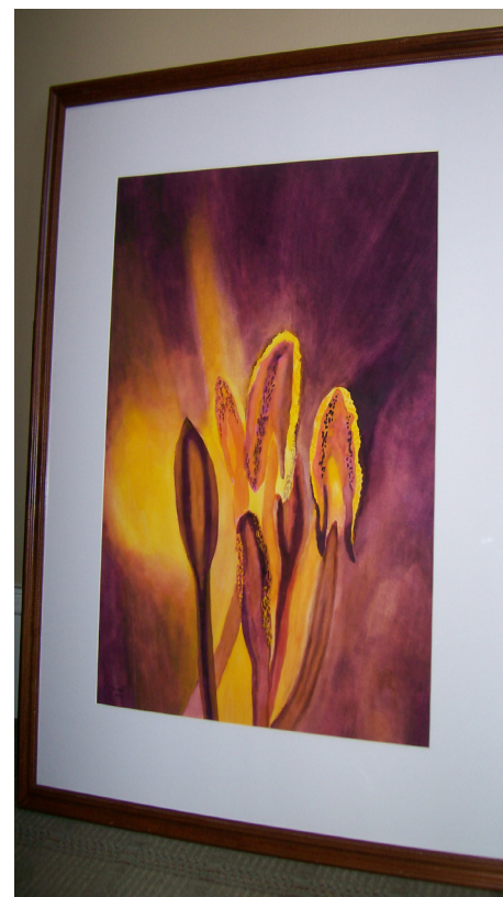
The above pictures are a series of daylilies emphasizing their anthers