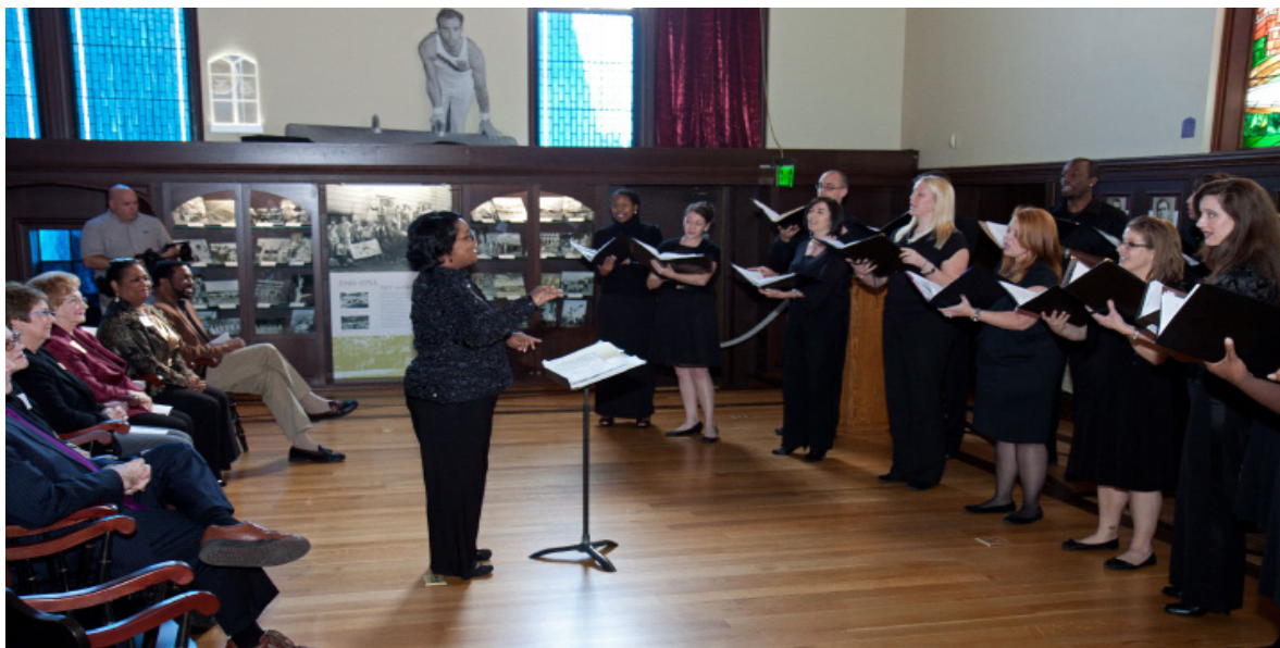
The FSU Chamber Choir singing “Lift thine Eyes from Elijah”; “Now is the Month of May-ing”; “Hymn To the Garnet and Gold”; “When the Trumpet Sounds” and “For the Sake of Our Children”, to the assembled audience.