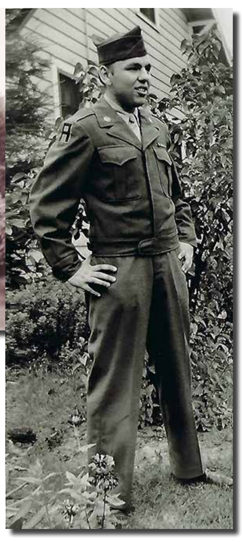
RETIREE JOURNAL 6

After one semester at Harvard, with the conflict in Europe being difficult, the new program was dropped and students who had reached their 18th birthday were designated for regular Army duty.