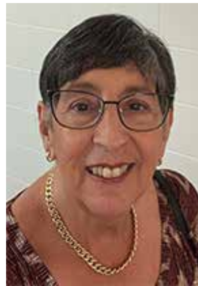
Jill Adams, ARF Photographer