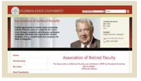
WEBSITE - http://retiredfaculty.fsu.edu

NON-PROFIT U.S. Postage PAID Tallahassee, FL Permit No. 55