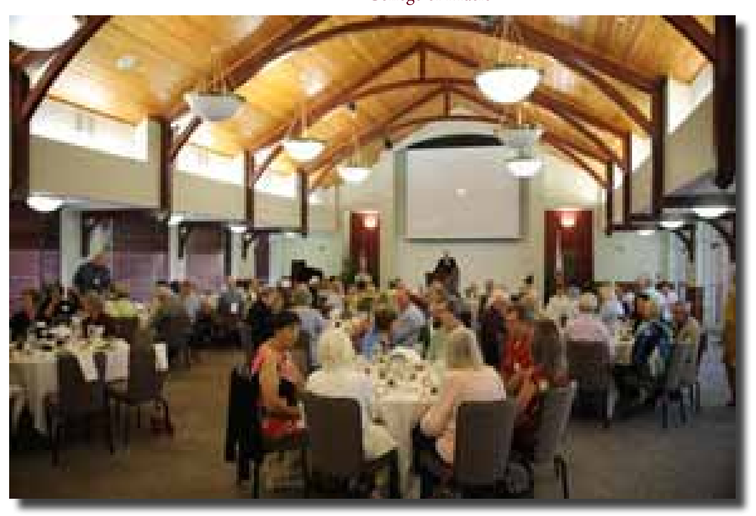
Wonderful crowd in the Alumni Center Ballroom