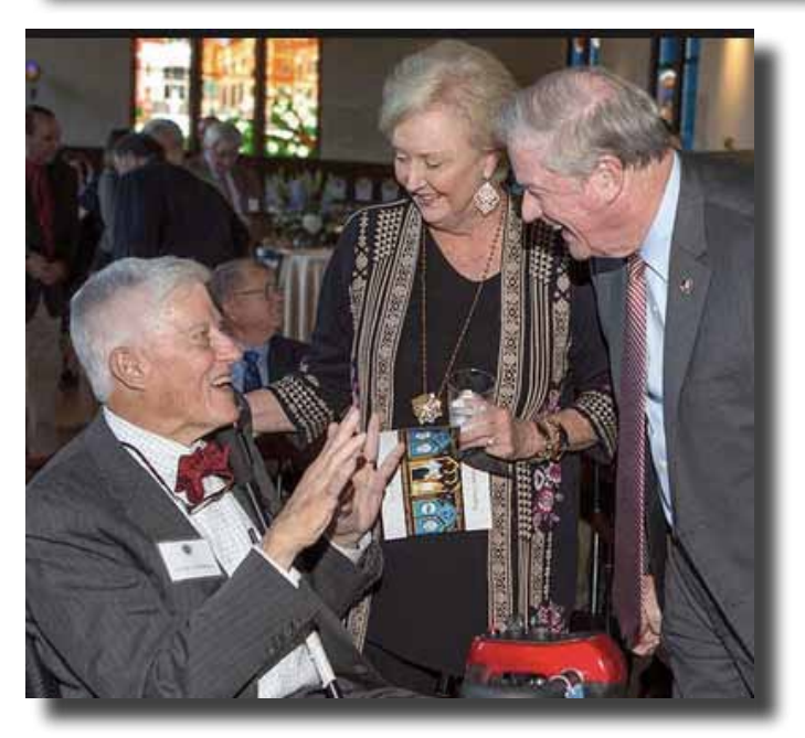
RETIREE JOURNAL 7