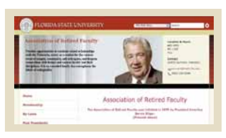
WEBSITE - http://retiredfaculty.fsu.edu